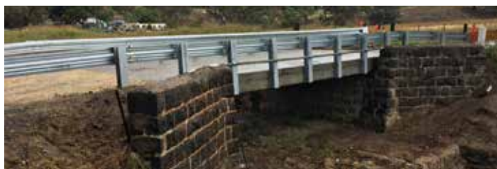
Dog Trap Gully Road, Rowsley - Bridge Replacement

Council's last remaining timber bridge was replaced on Dog Trap Gully Road in December 2018. The new concrete structure along with new guard rail and improved road approaches will now stand up to any potential flooding events.