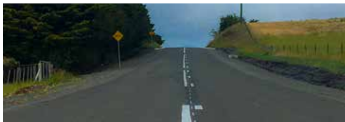
Myrniong–Korobeit Road, Myrniong – Road Rehabilitation

Road rehabilitation works on Myrniong–Korobeit Road were completed in November 2018. This segment was 300m in length and started from the Old Western Hwy. The works widened the road through a crest and included new kerb and channel installation, pavement improvements, property access improvements and associated safety measures.