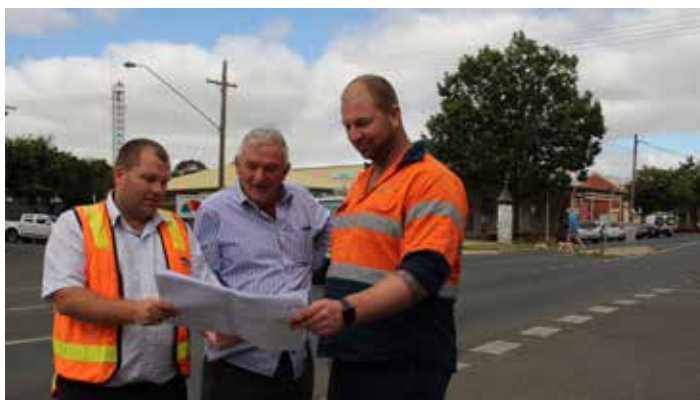
Ballan Main Street - Prior to construction.

Stage 2 of the Inglis Street Streetscape works kicked off in early January in the Ballan CBD. These works continue from stage 1 delivered last year and are located between Fiskin Street and Cowie Street (south side). The works are anticipated to be completed in June 2019.