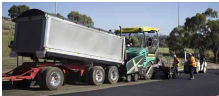
Wittick Street, Darley

Rehabilitation and asphaltting works on Wittick Street, Darley were completed in February 2019. These works rehabilitated the poor existing pavement and included fresh linemarking.