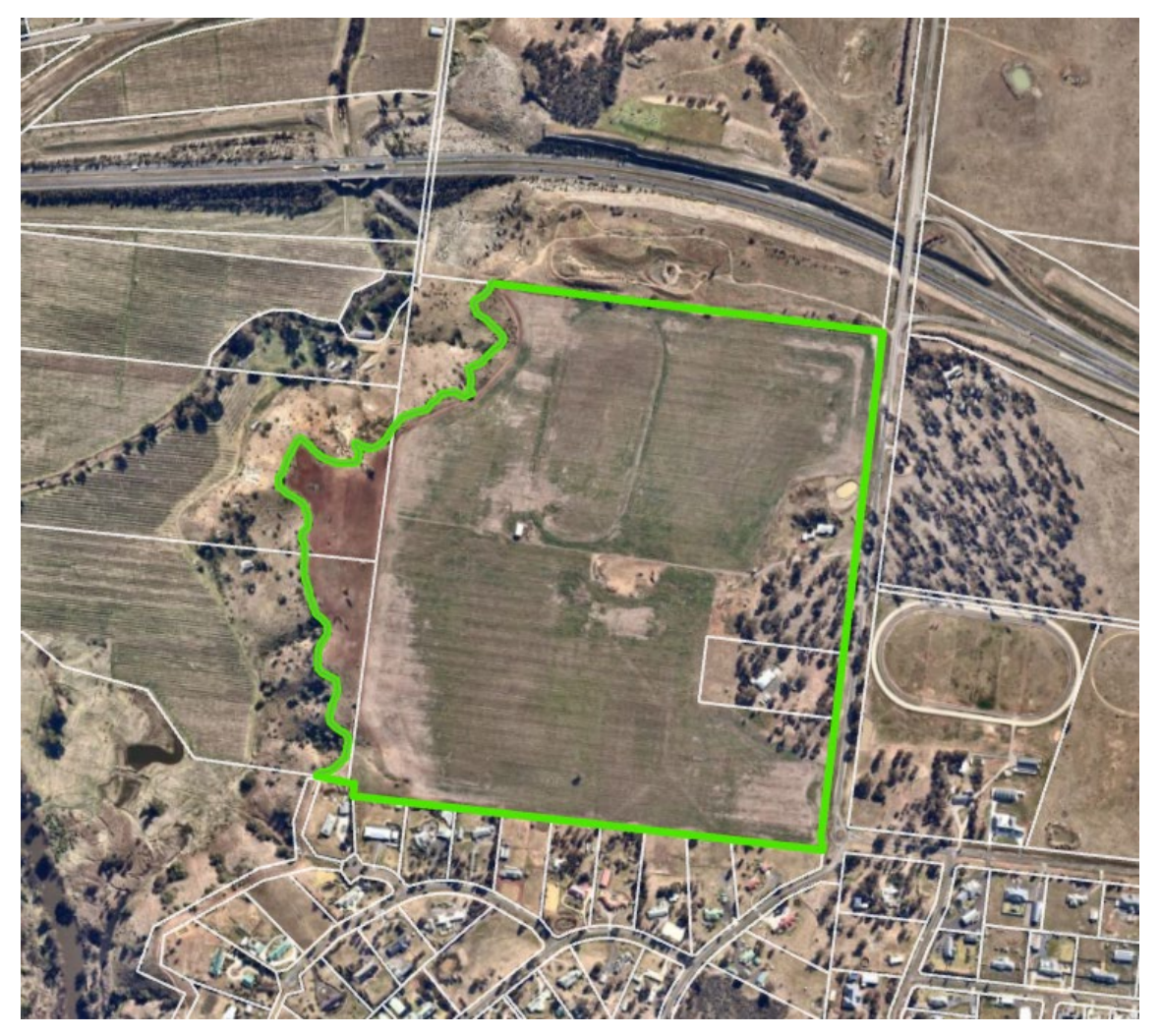
Figure 2: Site boundary overlaid over 2023 Nearmap image

around Hopetoun Park Road and areas of the escarpment. The boundary of Amendment C103Moor is illustrated in Figure 2.