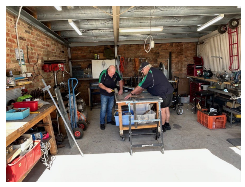
Shed 3 – Metalwork area in old Stables