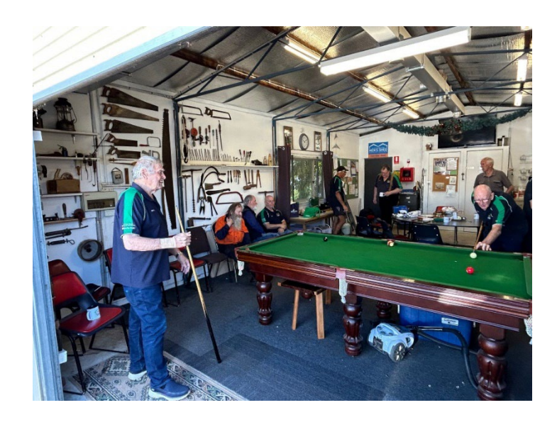
Shed 1: Social space that also serves as kitchen and meeting area, and includes a tool museum.