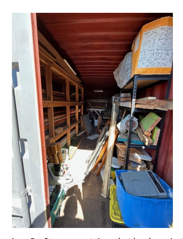
Area 5 – Storage container that has been installed next to the old Stables to provide space

Due to increasing demand for membership of the Bacchus Marsh Men's Shed, the groups membership numbers have grown annually. Unfortunately, due to the lack of further space for growth at their existing location, the group has made the difficult decision to cap their membership numbers at 40 members.