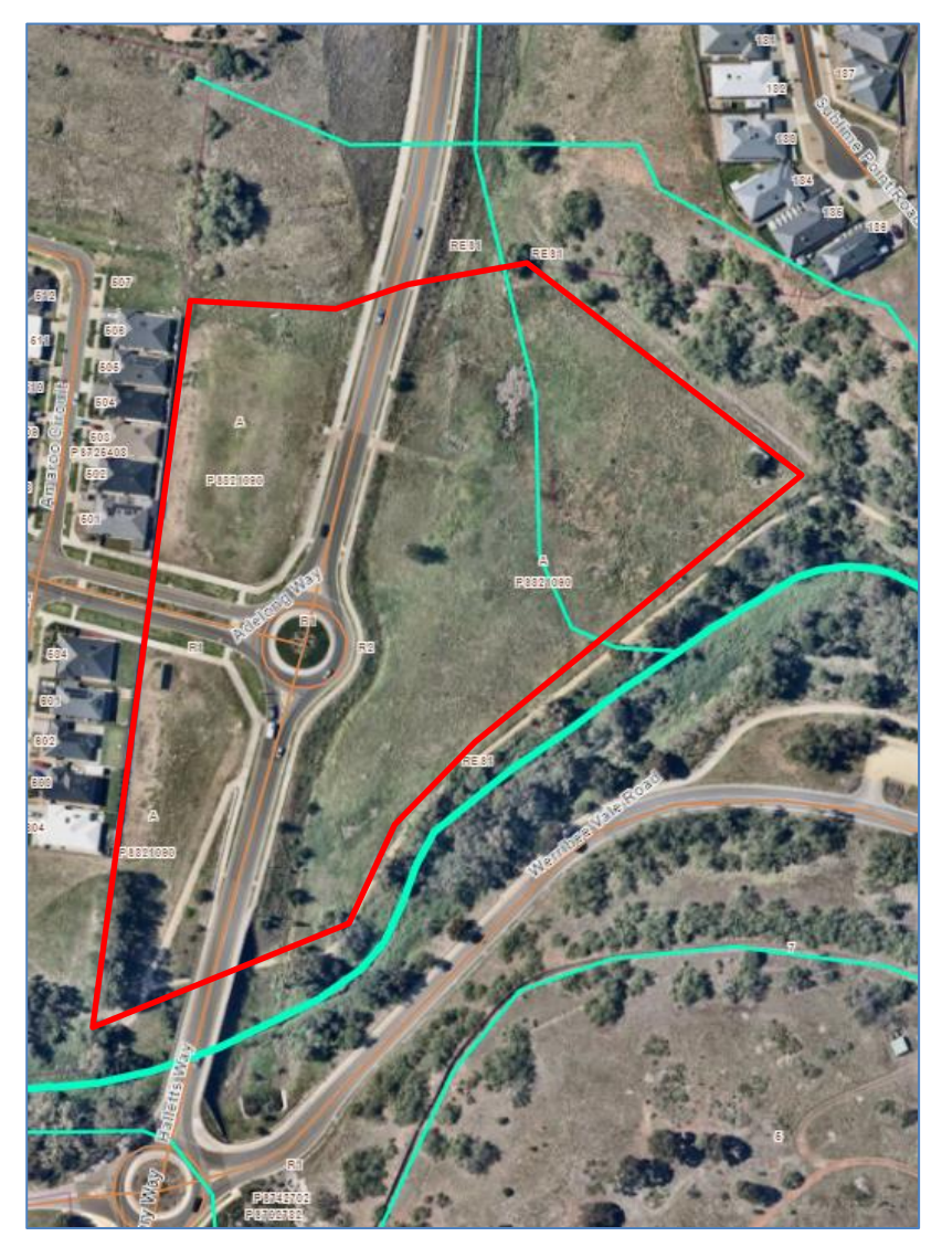
Figure 2: Site boundary overlaid on 2024 aerial image.

The subject land is relatively clear of vegetation and the western portion of the land was used for vehicle parking during construction of the Underbank Estate.