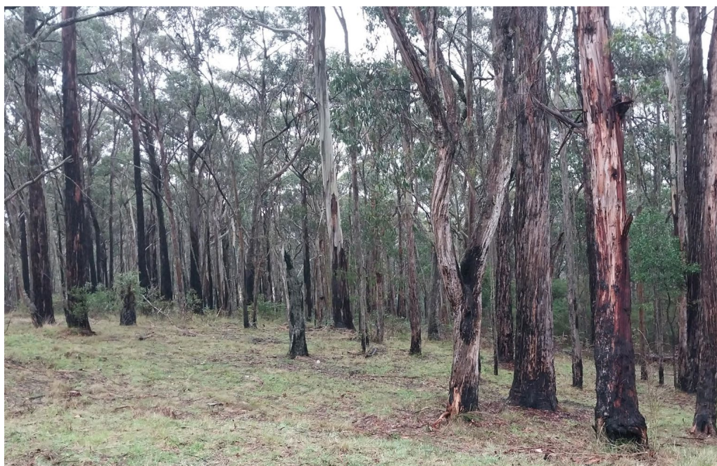
Figure 2 - Photo of OS87 (see Figure 1)