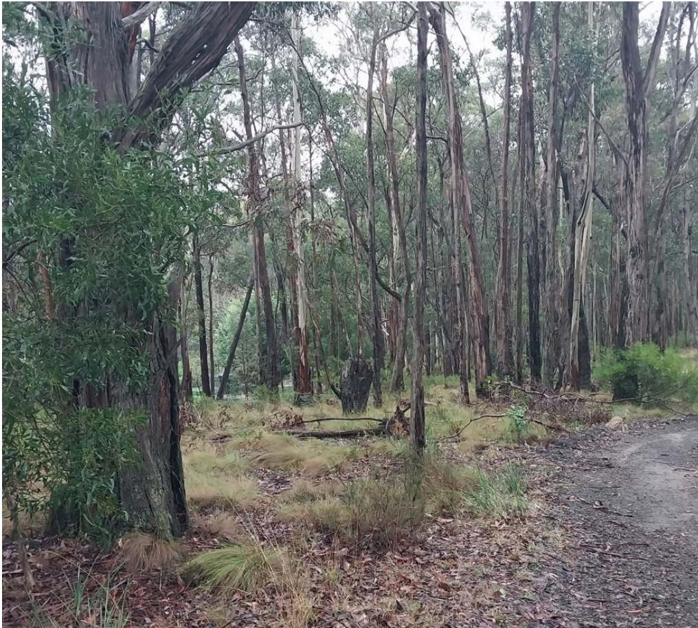
Figure 3 - Photo of OS86 (see Figure 1)