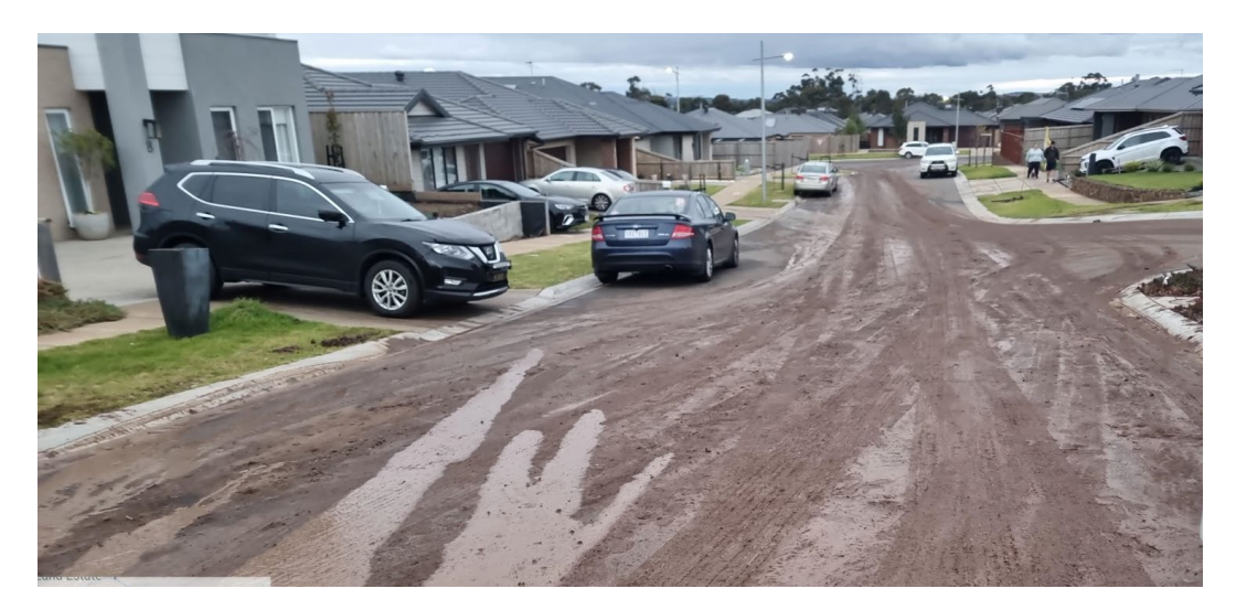
Figure 3 – Mud on Road washed to the underground drainage system.