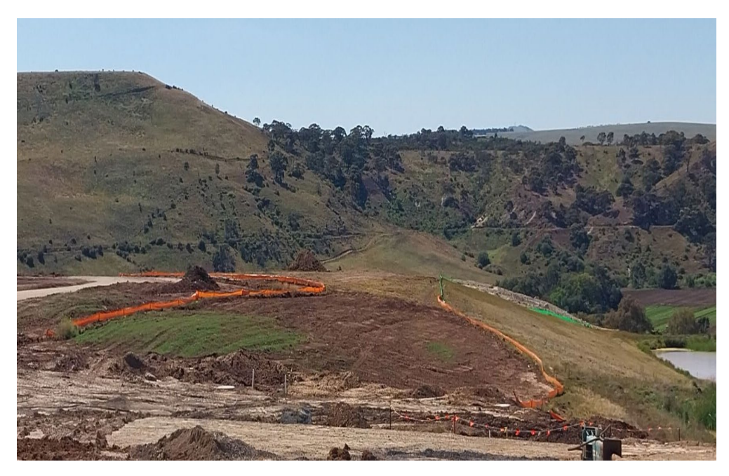
Figure 5 – Silt fencing for sediment control