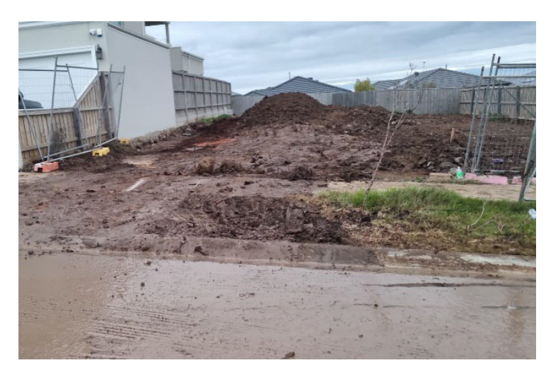
Figure 2 – Earthworks on Building Site

debris and high sedimentation from building sites. These issues are sent on to Council's planning department for further investigation and local law enforcement.