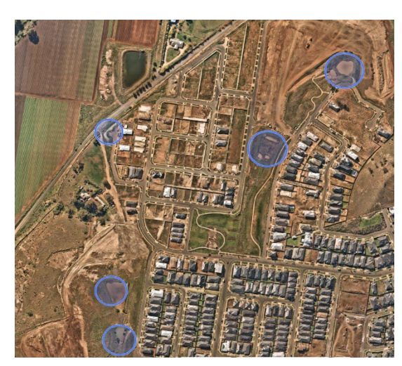
Figure 1 - Southern Rural Water Channel (left) and Newly Constructed Basins (Right)