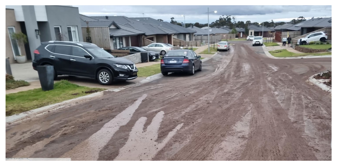
Figure 3 – Mud on Road washed to the underground drainage system.