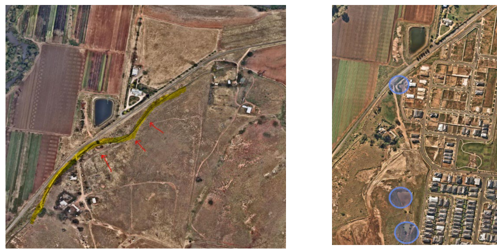
Figure 1 – Southern Rural Water Channel (left) and Newly Constructed Basins (Right)

Prior to the commencement of the Stonehill Development, a Southern Rural Channel was intercepting stormwater flows from land to the south of the channel. Removal of the channel during the construction of Stonehill Stages 24/25 caused stormwater to cross the boundary of the development site into a Swale Drain on McCormacks Road which ultimately drains into the Werribee River. The removal of this channel (as conditioned by Southern Rural Water) was carefully designed with Water Sensitive Urban Design facilities to control the water quantity and quality. Five (5) sediment basins have been constructed to manage sediment and detain stormwater flows from the development site. These basins are still under the management of the developer as sediment basins due to active construction site. Into the future these basins will be planted out with carefully selected plants and handed over to Council for ongoing maintenance to ensure that the water quality is maintained into the future.