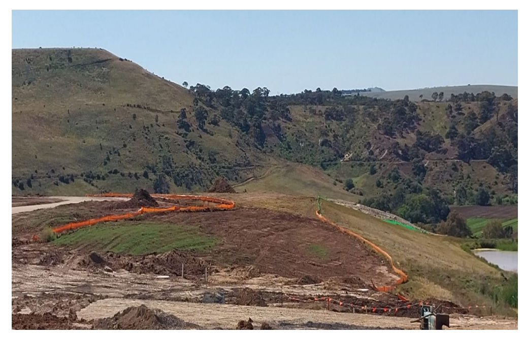
Figure 5 – Silt fencing for sediment control