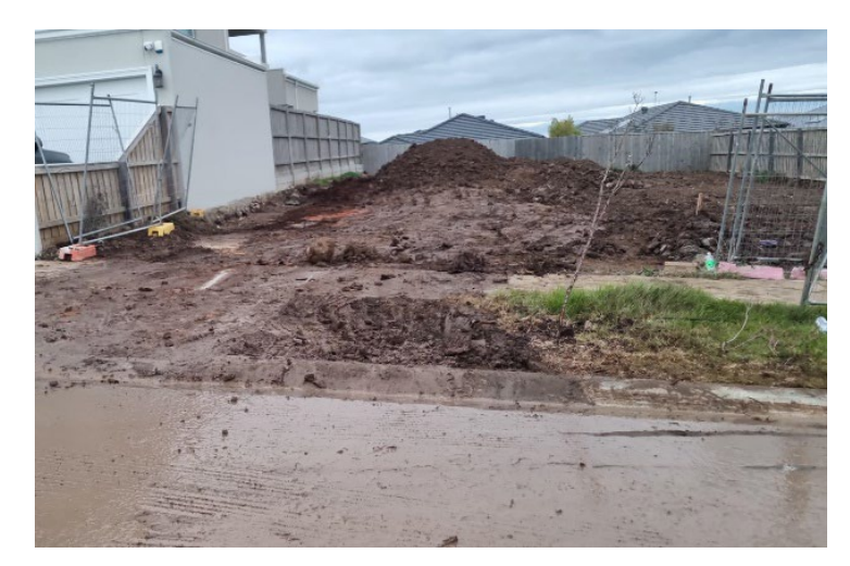
Figure 2 – Earthworks on Building Site