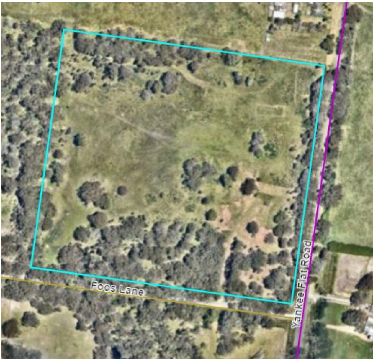
Figure 1: Aerial image of the site