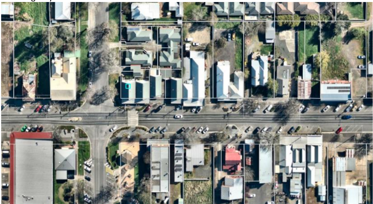
Figure 1: Aerial photograph of the subject site

The subject site is situated on the corner of Inglis Street and Fiskin Street occupying an area of 181sqm with a frontage of 9.3m. The land is relatively flat in nature mostly covered by the existing building on site with scattered vegetation located to the rear of the site. The site has one access point provided via Inglis Street to the south of the property. The site is currently used as a real estate agency office.