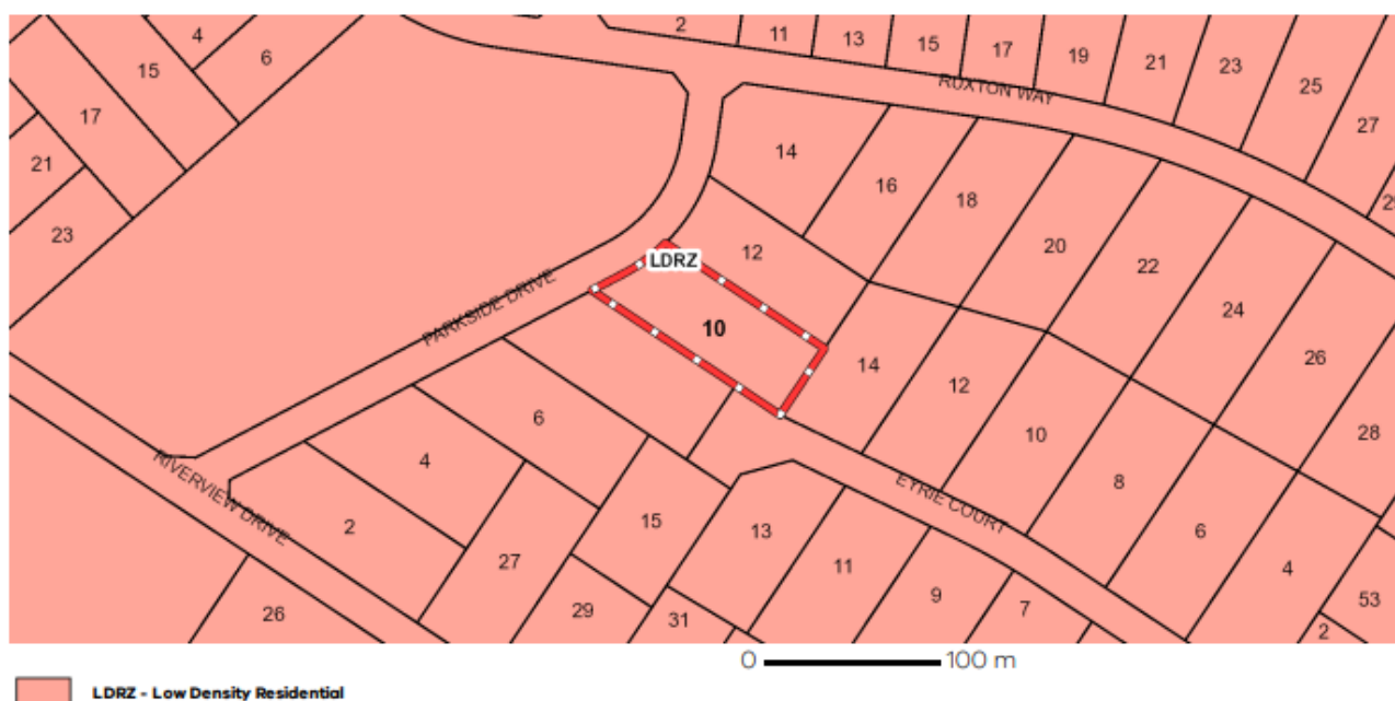
Figure 2: Zone map

The map below indicates the location of the subject site and the zoning of the surrounding area.