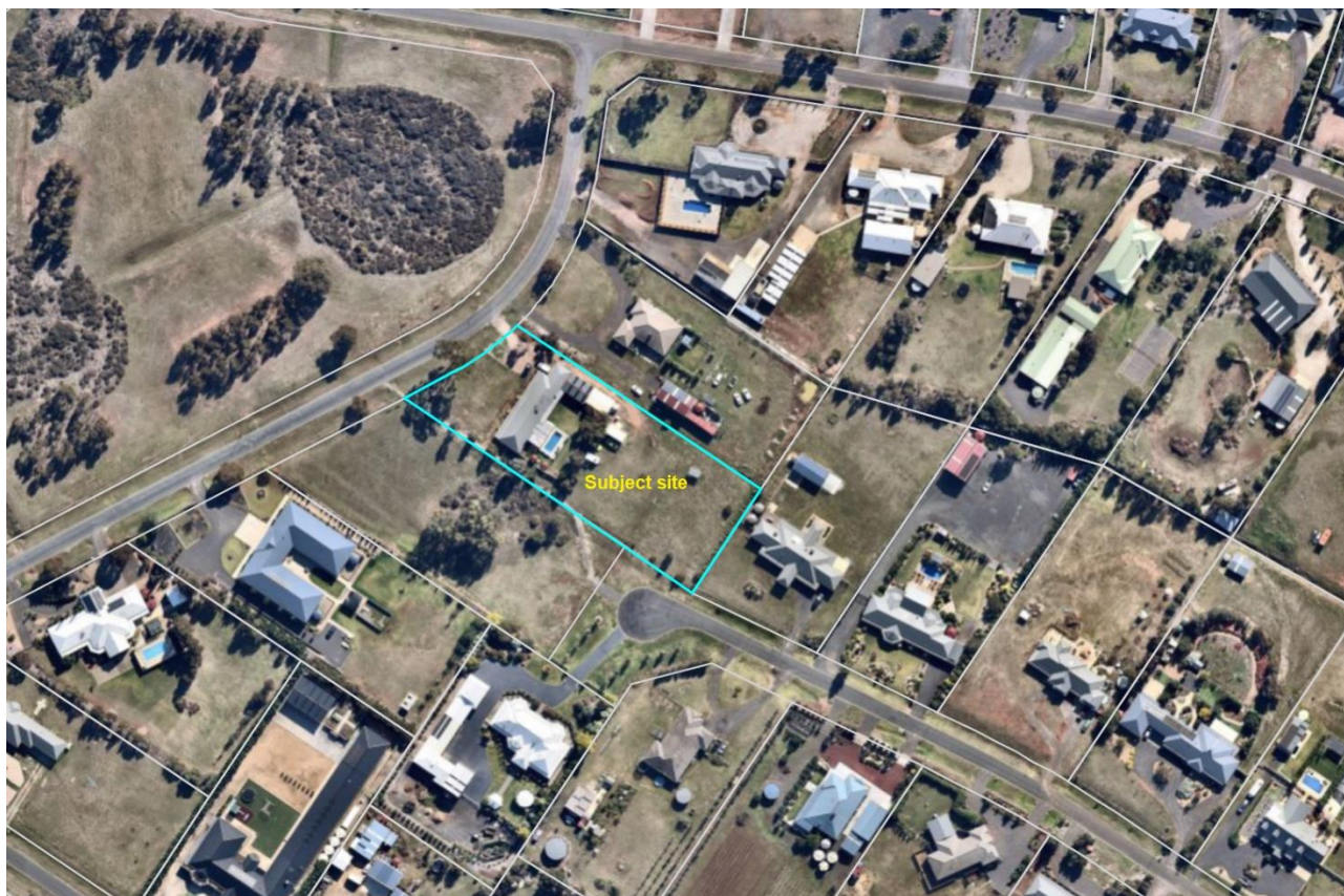
Figure 1: Aerial photograph