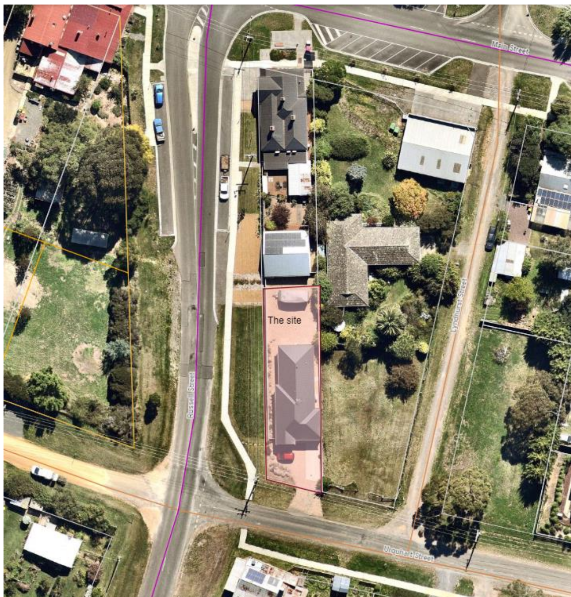
Figure 1: The site (aerial view)

The site is formerly described at Lot 2 on Plan of Subdivision 723398K and is 525sqm in area.