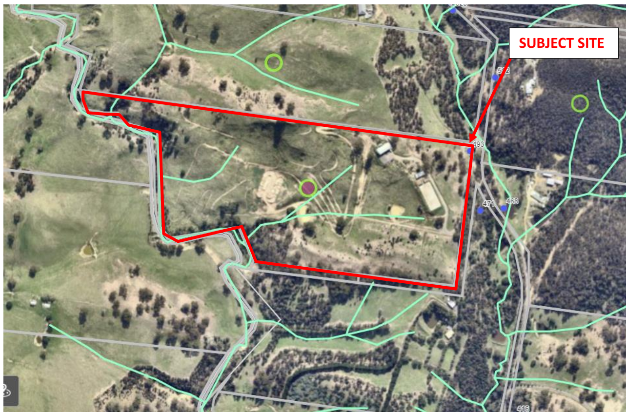
Figure 1: Aerial photo of the site

The site contains a shed, water tanks, a horse riding menage, stock yards, fenced horse paddocks, two dams and a private motorcycle track. There is a small amount of scattered vegetation across the site, with a patch of bushland located on the southwest corner and riparian vegetation along the Korkuperrimul Creek.