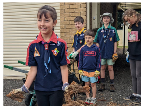
A young Ballan Scout helps stack free firewood for our vulnerable residents