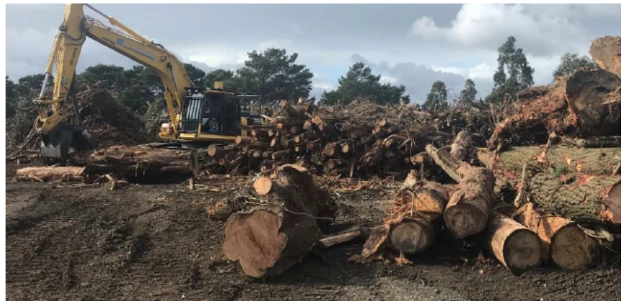
Ballan Transfer Station – Sorting reusable timber from Storm Debris and processing debris into mulch

DELWP and Parks Victoria crews have been on the ground working on the clean up of public land since the June 9 Storm Event. The storm impacted 1,500km of roads and 150km of walking tracks across 82,000 hectares.