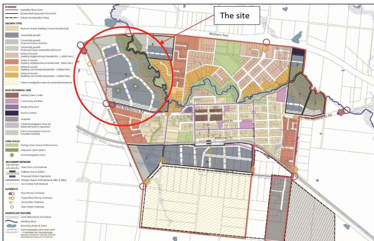
Figure 1: Ballan Framework Plan from Clause 11.01-1L-03 of the Moorabool Planning Scheme