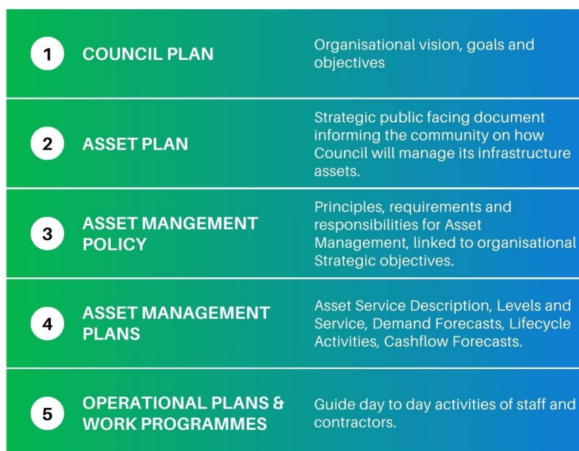
Figure 1: Asset Management Framework

provides a framework for comprehensive, accountable, and transparent asset management practices.