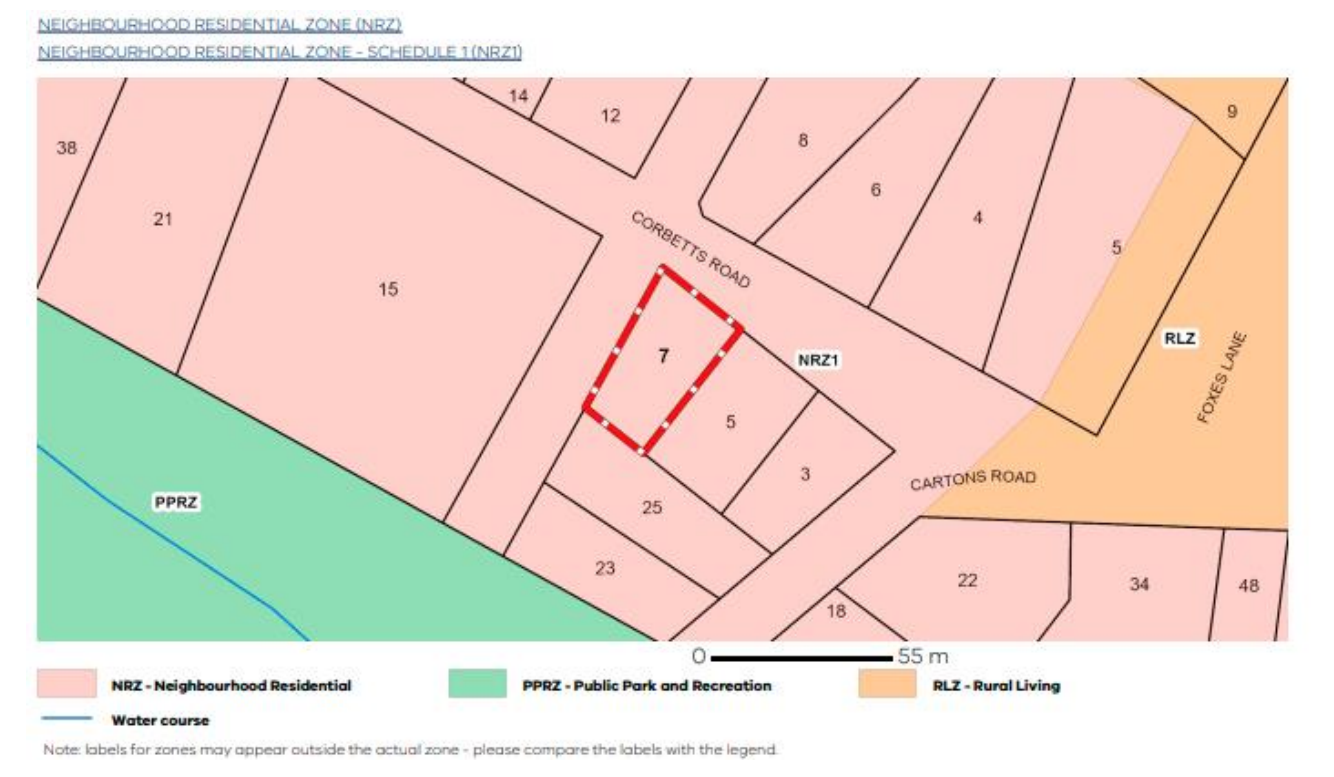
Figure 2: Zone Map