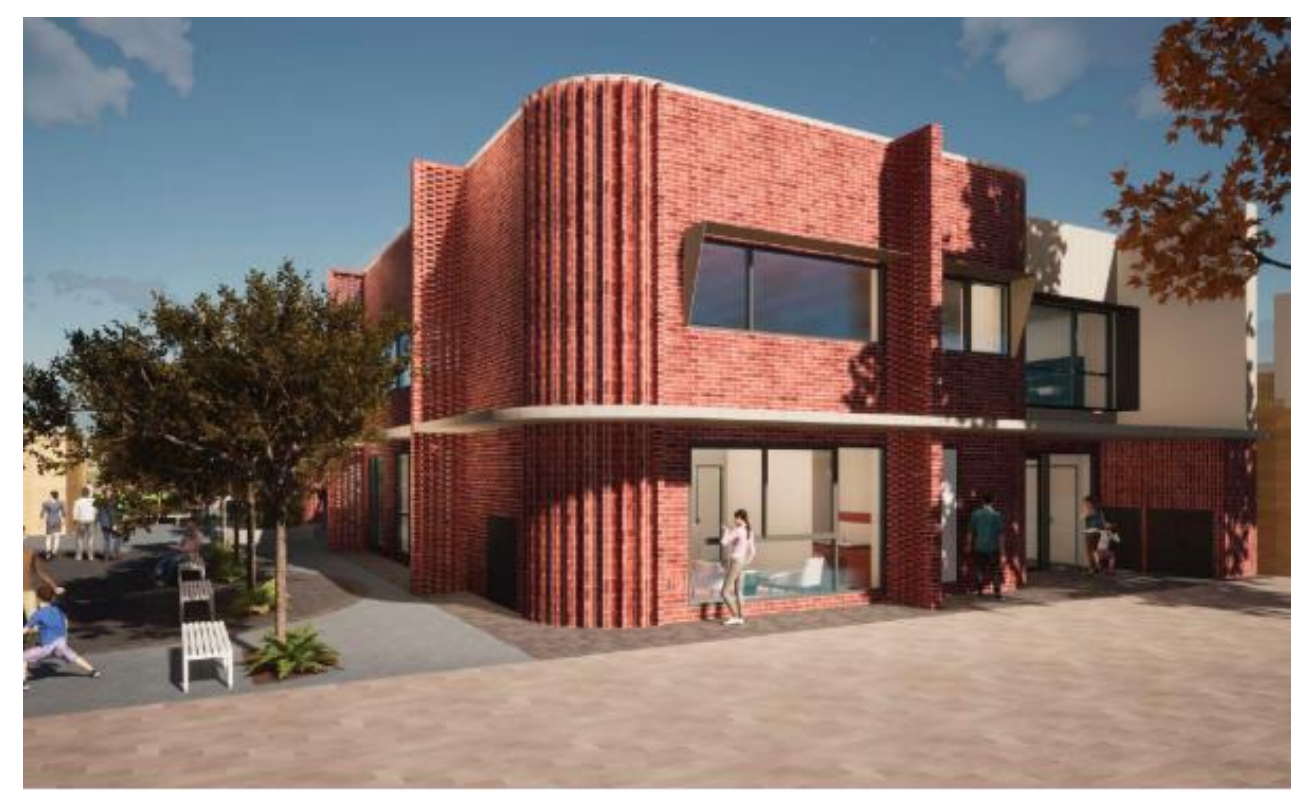
Figure 4: Photo Representation of the building from Inglis Street