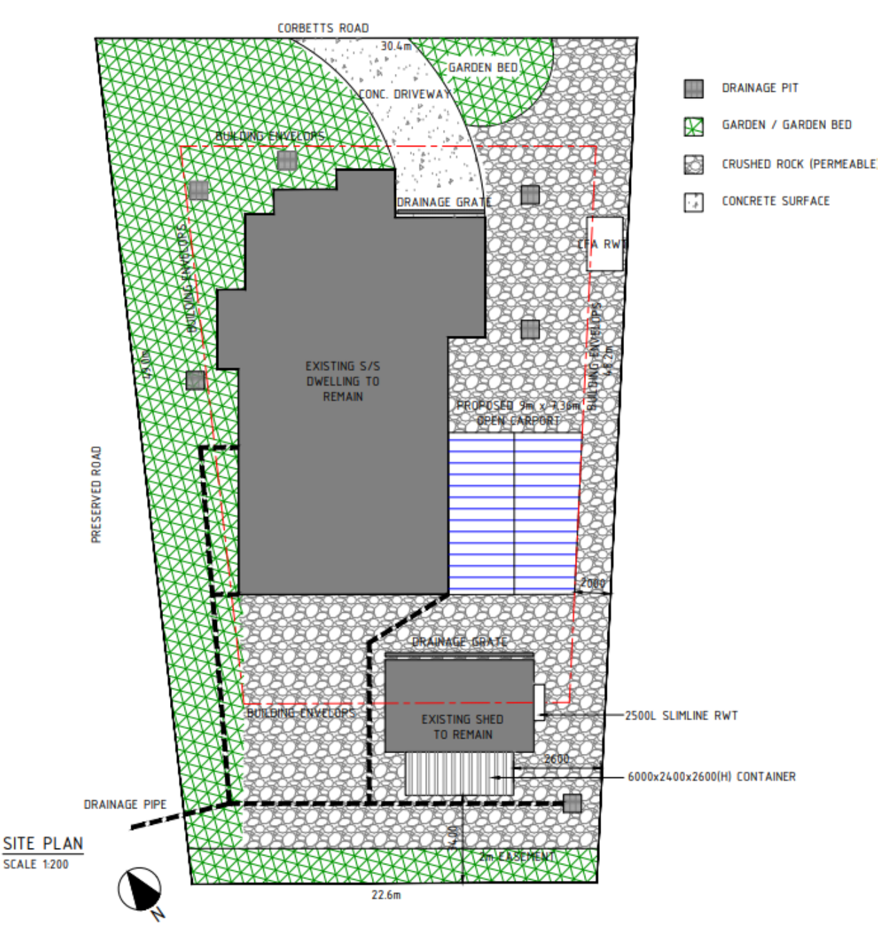
Figure 3: Proposed site plan.