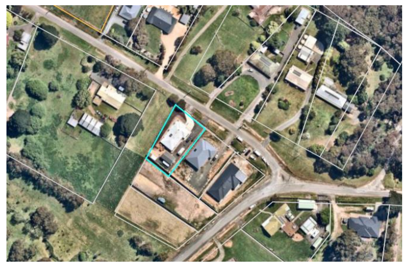
Figure 1: Aerial photograph

The site is developed with a single storey brick dwelling with a 271sqm floor area, 60sqm Colorbond shed, 9.4sqm home studio and a 14.4sqm permanent placed shipping container used for personal storage, the latter for which retrospective approval is sought as part of this current application.