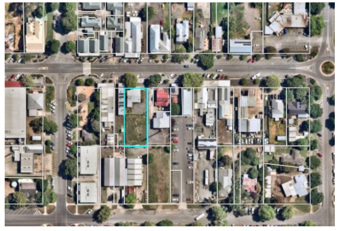
Figure 1: Aerial Photograph

The subject land is located on the southern side of Inglis Street and is 20.14m in width, 50.20m in length for a land area of 1,014sqm. There is a drainage and sewer easement running parallel with the western property boundary. The site contains a former bank building, single storey in height. The existing building is comprised of brick walls, flat metal roofing and reflects simple modernist architectural detailing. The frontage contains a pedestrian ramp and side metal railing to allow access for wheelchairs. The easter side of the site has a single car width crossover providing access to an unconstructed driveway and informal car spaces available for staff.