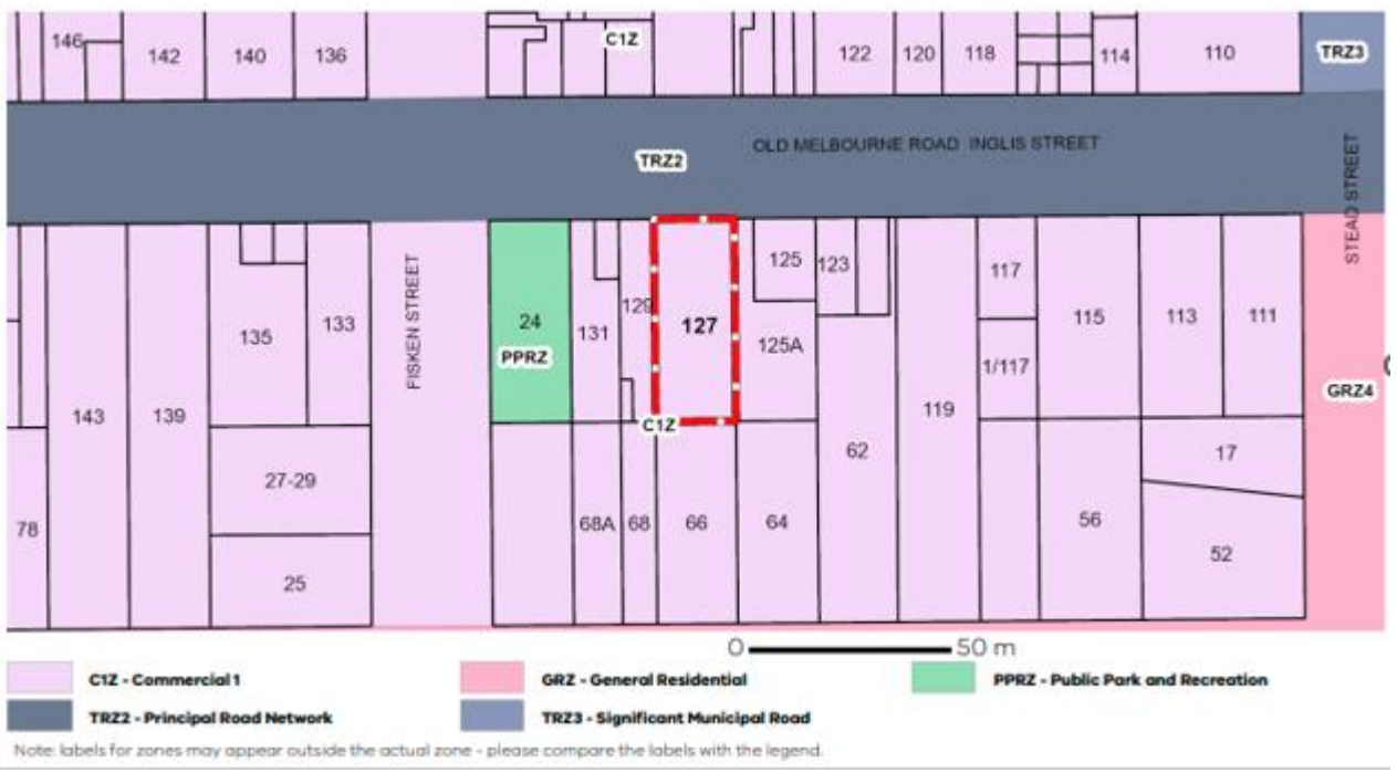
Figure 2: Zone Map