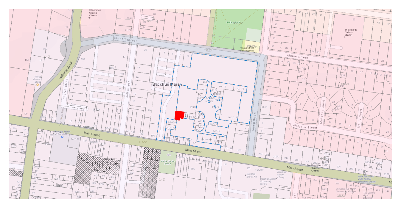
Figure 1: Site context map

Main Street is in a Transport Zone 2 managed by the Department of Transport and Planning whilst Bennett and Young Streets are in a Transport Zone 3 managed by Council.