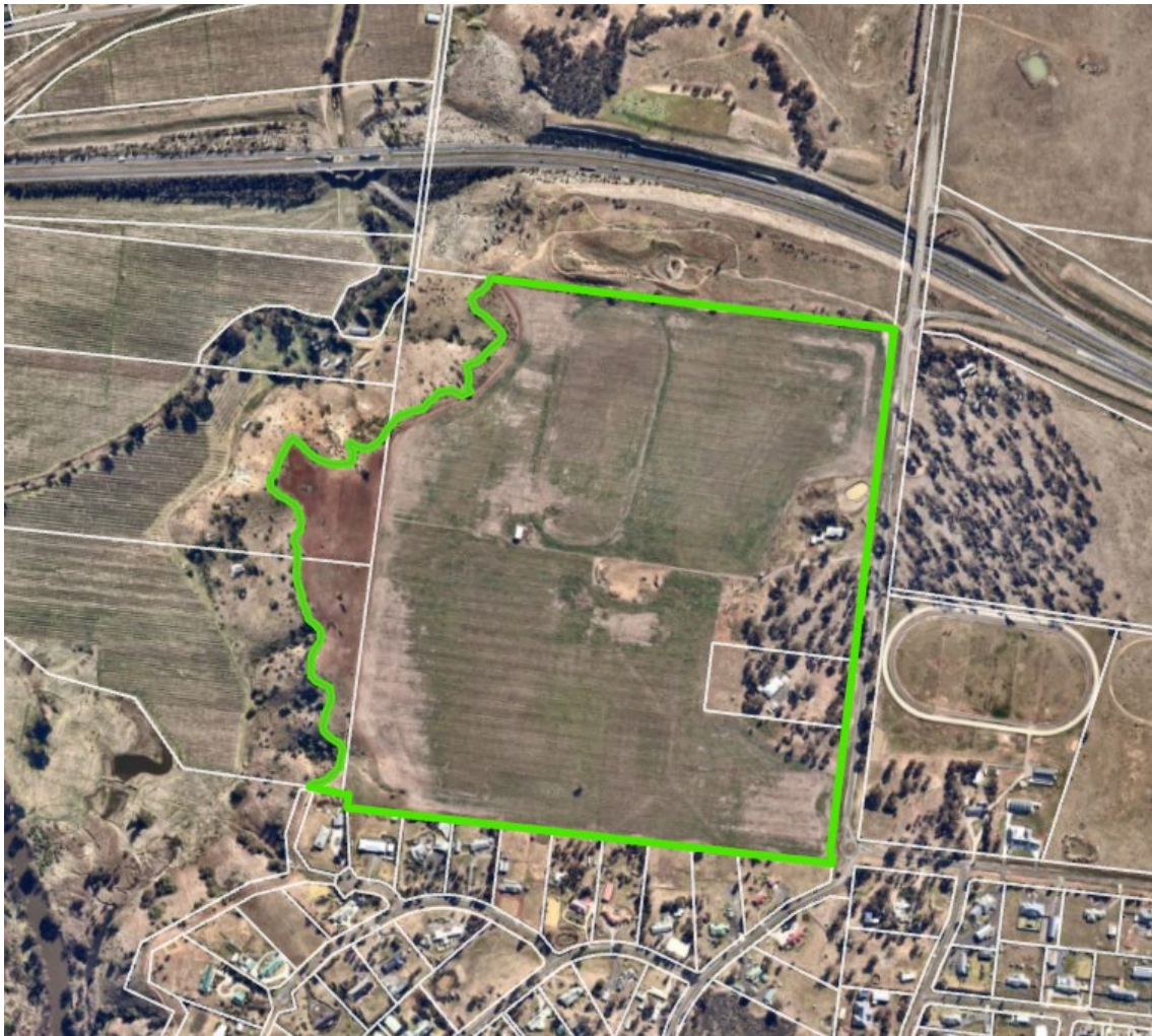
Figure 2: Site boundary overlaid over 2023 Nearmap image

around Hopetoun Park Road and areas of the escarpment. The boundary of Amendment C103Moor is illustrated in Figure 2.