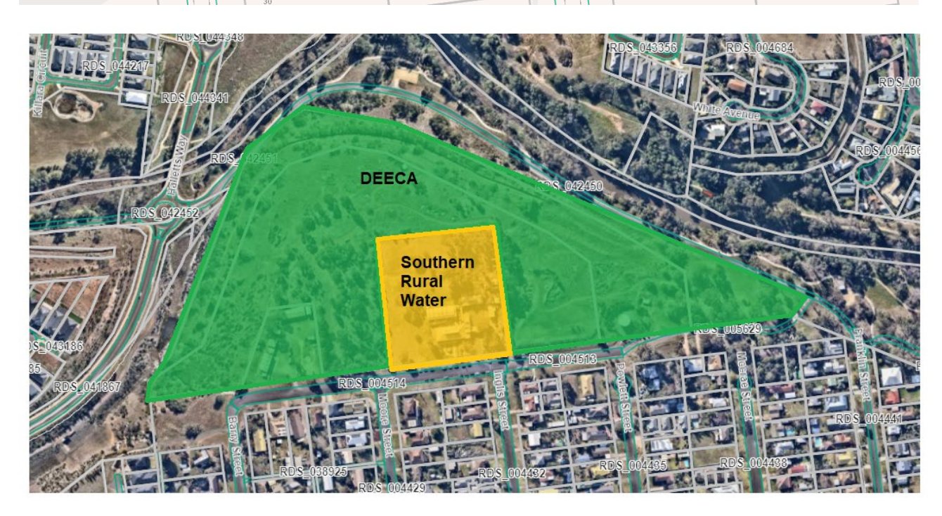
Figure 4 - Direct Consultation Area - Landowners