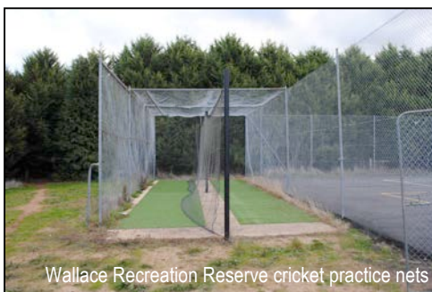
Wallace Recreation Reserve cricket practice nets