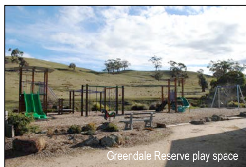
Greendale Reserve play space