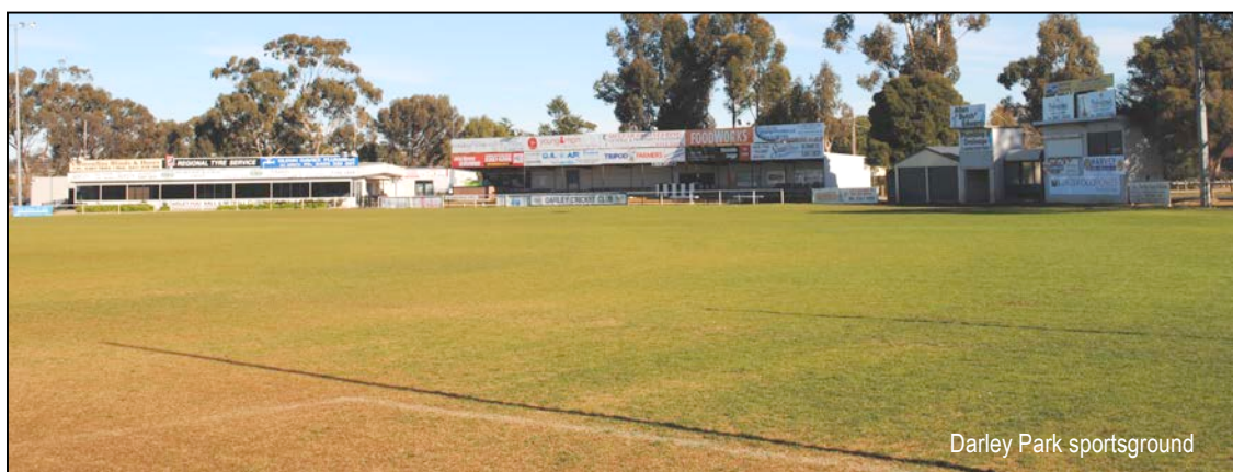
Darley Park sportsground

Under the powers and responsibilities vested in the committees of management, the committees undertake the management and maintenance of reserves, ensure facilities are available for public use, and commit to liaising with Council in relation to all major works and capital development to ensure compliance with legislative requirements. In relation to fees and charges paid by permanent reserve user groups, Council collects and retains all fees payable at reserves located in the east of the Shire, whilst the respective reserve committees retain all fees payable at reserves located in the west of the Shire.