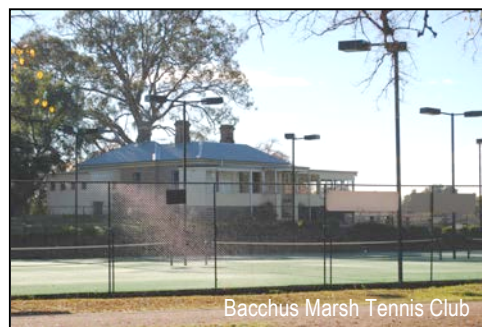
Bacchus Marsh Tennis Club