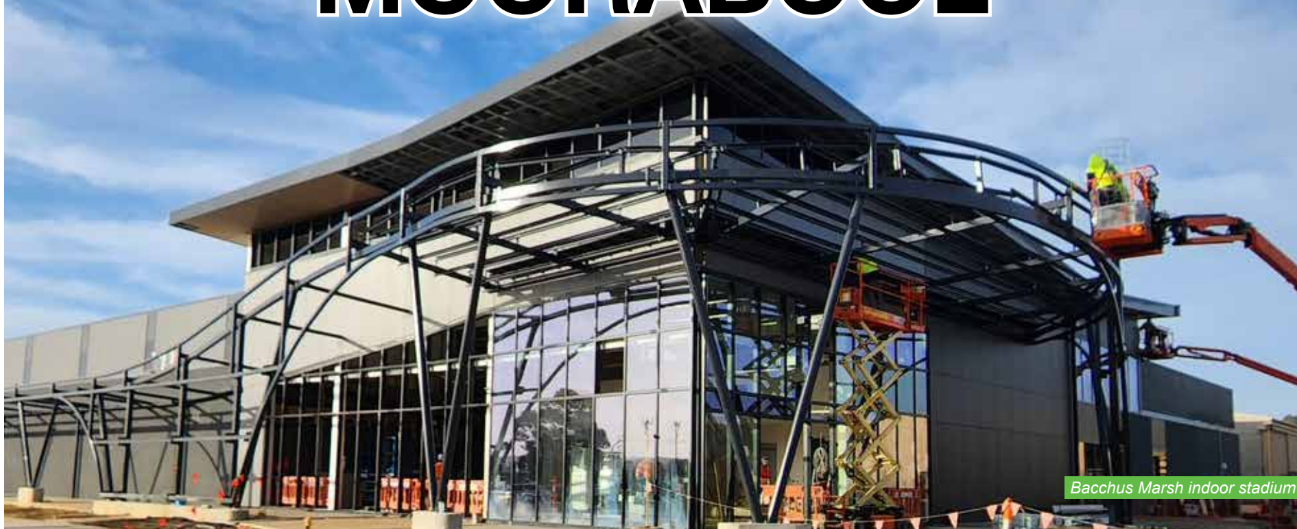
Bacchus Marsh indoor stadium

Close to $57 million of capital improvement works highlight Council's 2023/24 Budget, approved at a Special Meeting of Council in May.