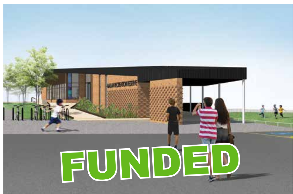
Ballan Recreation Reserve Pavilion