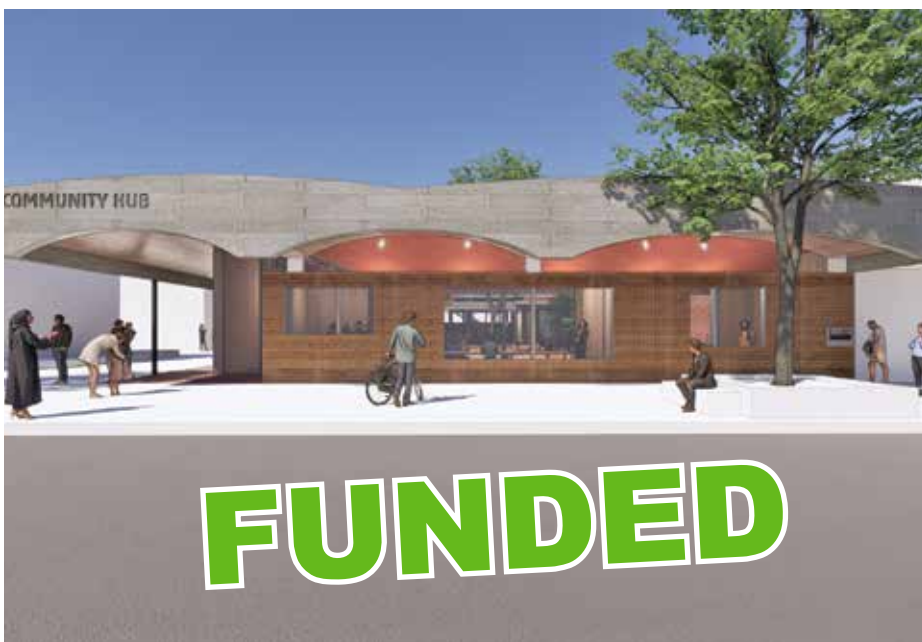
Ballan Library and Community Hub