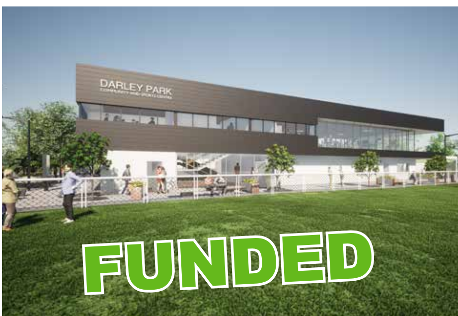
Darley Park Pavilion

Coming up to the Federal and State elections, Council has successfully advocated for funds for important projects throughout the Shire ... and there's more in the pipeline. See page 3 for details.