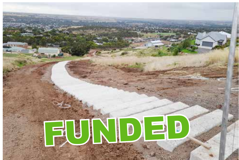
Bald Hill 1000+ Steps

Coming up to the Federal and State elections, Council has successfully advocated for funds for important projects throughout the Shire ... and there's more in the pipeline. See page 3 for details.