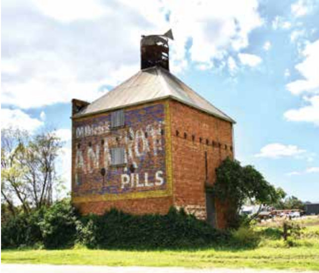
Chicory Kiln before the restoration, note the overgrown vegetation, weathered timber and top vent.

The Bacchus Marsh Lions Club have recently completed restoration works on the Chicory Kiln on Taverner Street in Bacchus Marsh. The project was instigated by the Lions Club in 2021, with the original intention of repainting the Dr Morse Indian Root pill sign. As the Kiln is protected by the Victorian Heritage Register, the Lions Club gained approval from Heritage Victoria to complete a historically accurate restoration, however painting the sign was not possible at this stage.