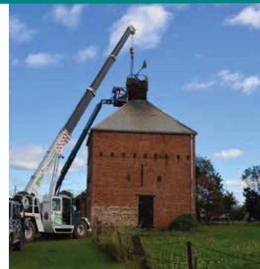
Chicory Kiln during the restoration, with support of volunteers and local businesses